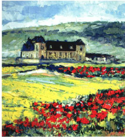
ISSUE 47 2015 / CHARLES TAYLOR ON FINE WINE AND CONTEMPLATION 2013 BURGUNDY / 2010 BAROLO / GERMAN WHITES / MOON MOUNTAIN